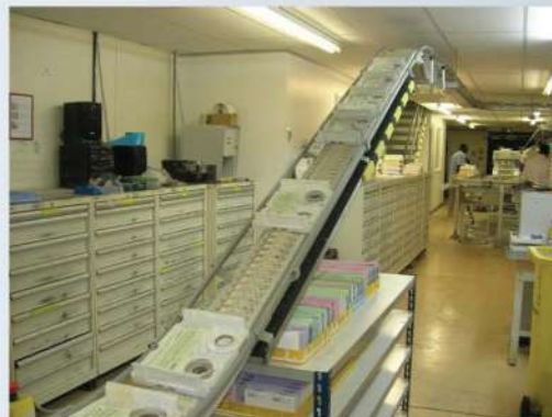
Friction Chain Incline