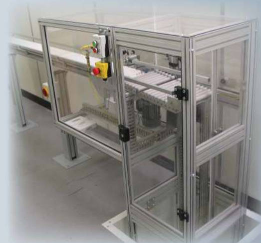
Mezzanine Floor Lifter