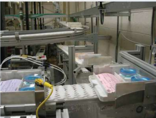
Side Push Unit