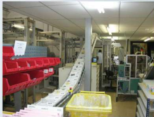
Friction Chain Decline up to 25°