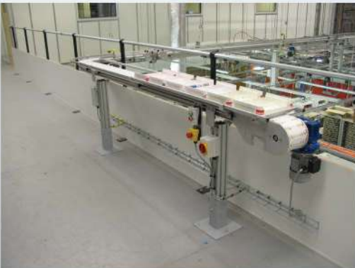
Feed onto Mezzanine Floor