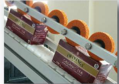
Plain Chain Conveyor with Box Incline Unit