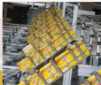
Chute with Pneumatic Controls