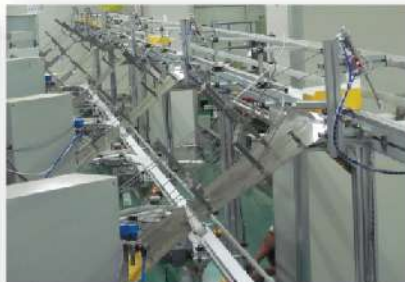
Chute for Filling Machine