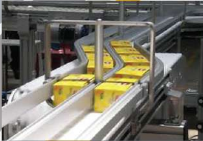
Plain Chain Conveyor

MODU System uses standard profile conveyor system. The plain chain conveyor is used to convey empty or filled tea bag boxes from one process to another. Our plain chain is suitable for accumulation of empty or filled tea bag boxes. Friction chain is used where inclination is needed.