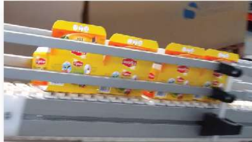
Friction Chain for 30° Incline